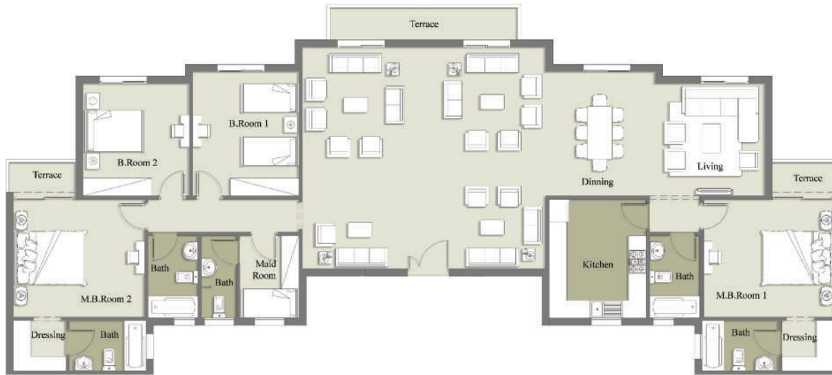
4 B.R TYPICAL FLOOR 335 M